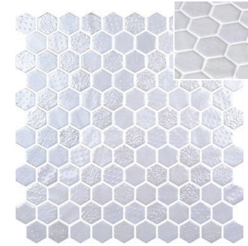
2003867 Hex Metal White 467